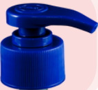
LP 2V 28/410