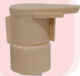
TLP A 24/410