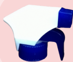
MTS A 28/400