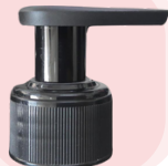
TLP A 28/410