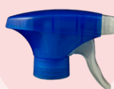
TS 100XL 28/400