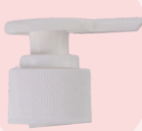
LP H6 24/410