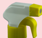
MTS B 28/410