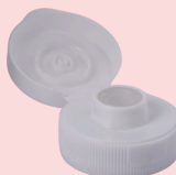
FTC 32 mm