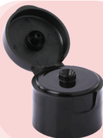
FTC 24 mm