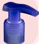
TLP Uno 24/415