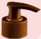
TLP G 28/410