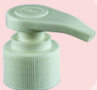
LP 2V 24/410