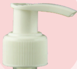
TLP G 24/410