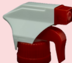
MTS A 28/410