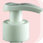
TLP Uno 28/410