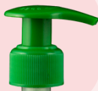
TLP C 24/410