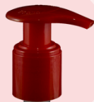
TLP C 24/415