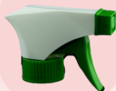
TS 100SC 28/400