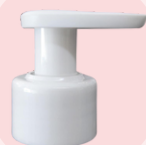
TLP A 28/410