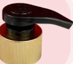
LP 3V 28/410