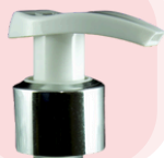
TLP Uno 24/410