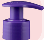
TLP C 28/410