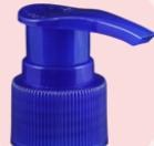
SDP G 24/410