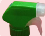
MTS B 28/400