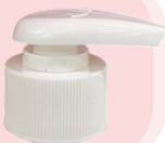
LP 3A 28/410