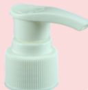
SDP G 24/410