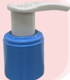
TLP G 24/415