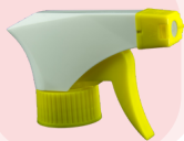
TS 100SC 28/400