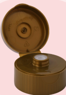
FTC 28 mm